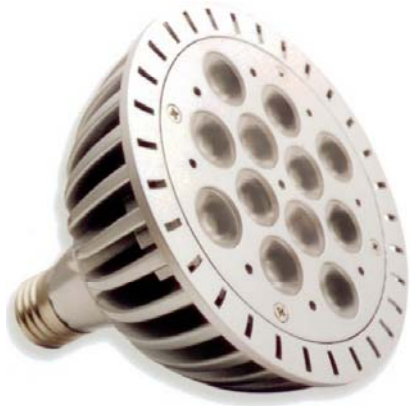
High Wattage Diode Version