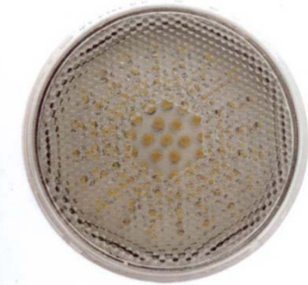
Low Wattage Diode Version

❖ PAR20 and PAR38 are available in floodlight category